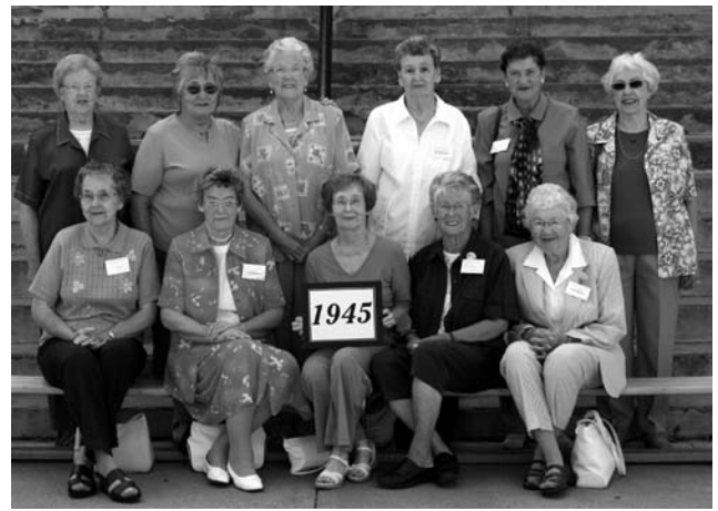
Class of '45