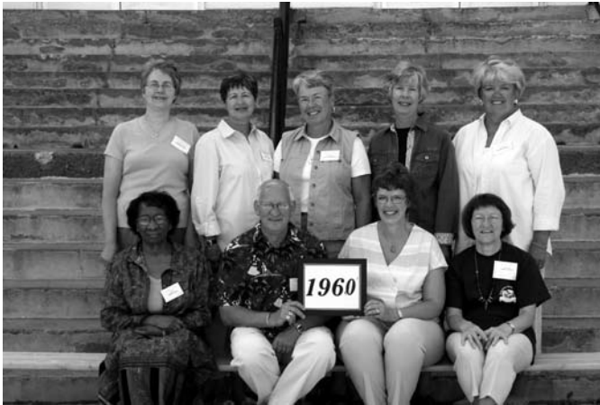
Class of '60