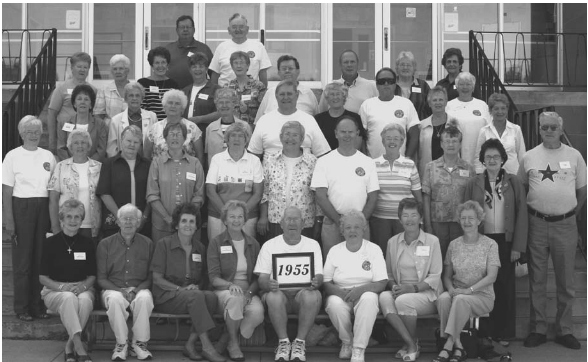
Class of '55