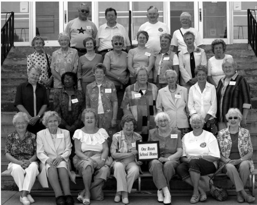
One-Room School Teachers