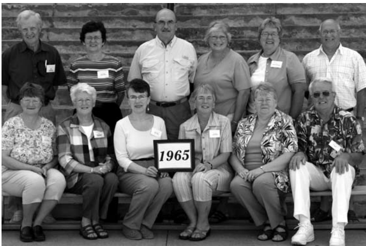
Class of '65