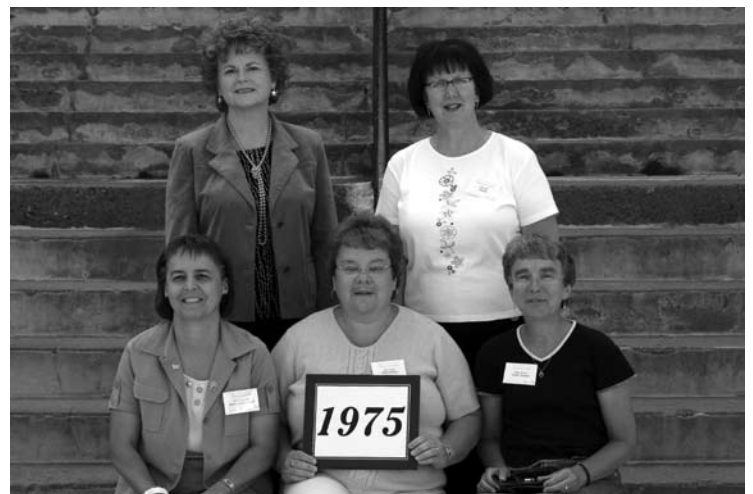
Class of '75