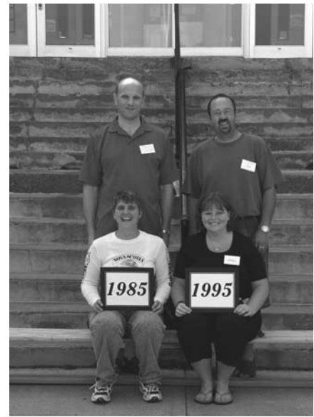
Class of '85 & '95