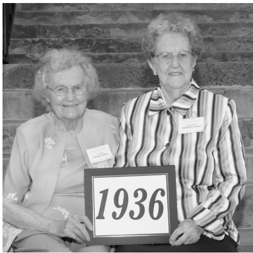
Class of 1936