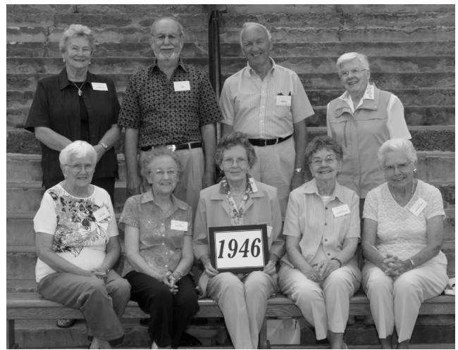
Class of '46