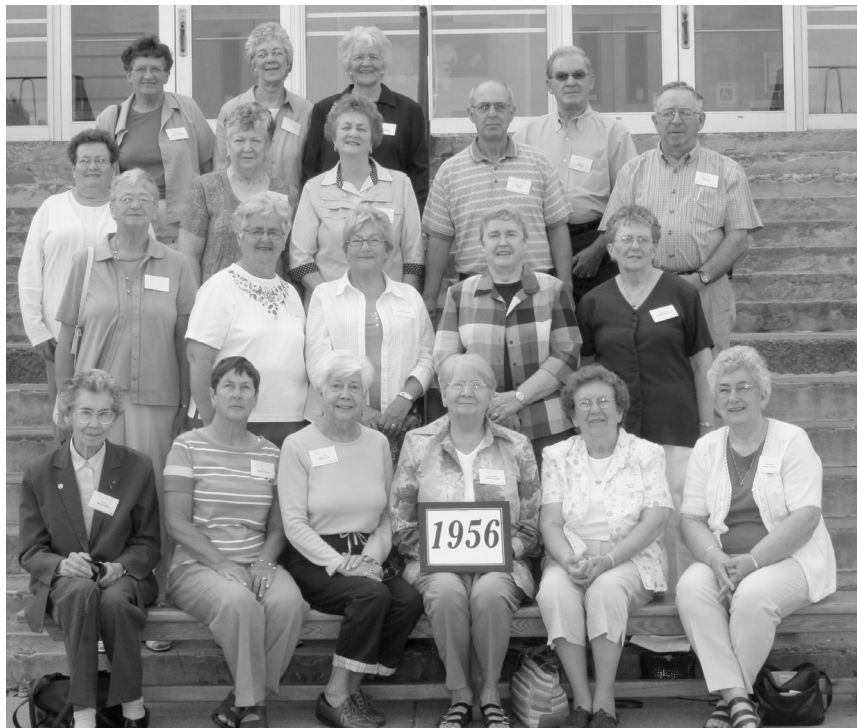
Class of '56