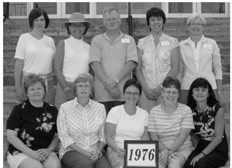
Class of '76