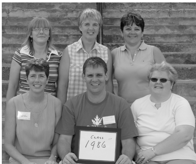
Class of '86