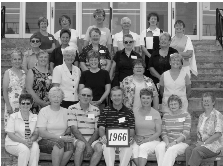
Class of '66