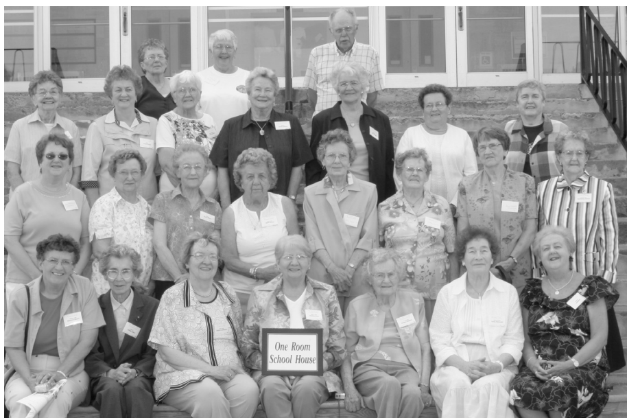
One-Room School Teachers