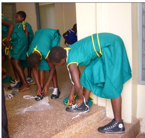
Ghanaian children receiving sneakers (and trying to figure out how to lace them) and uniforms. This was their first experience with either of these items which were provided from

resource persons to thousands of teachers and headmasters in deprived schools in all ten regions of the country. The Canadians and their Ghanaian counterparts have also collaborated in the production