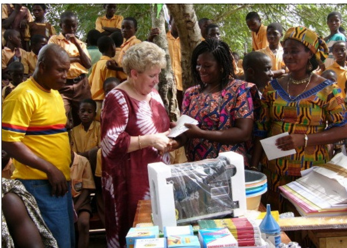
A presentation to schools in Ghana from NSTU Book Mark Project.

Nkabom II is concentrating on the needs of teachers and primary schools in very poor communities across the country. In the past thirty months the