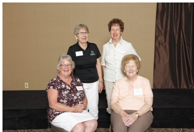
Class of 1959