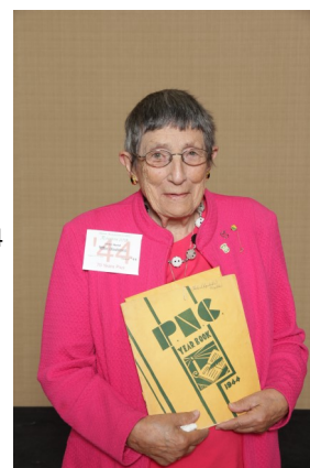
Class of 1944