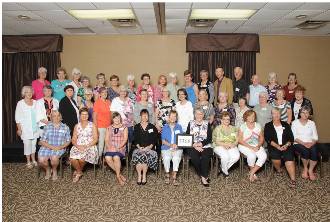
Class of 1968