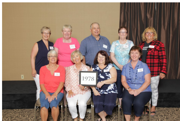
Class of 1978