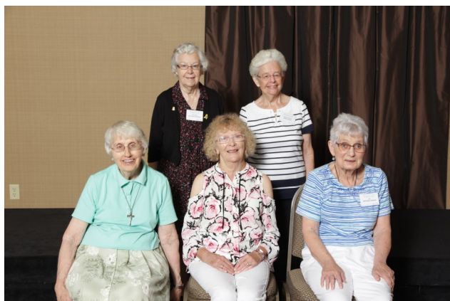
Class of 1953