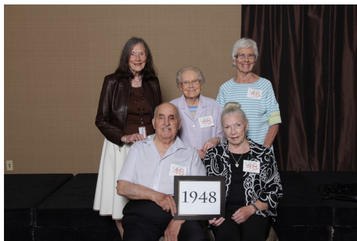
Class of 1948