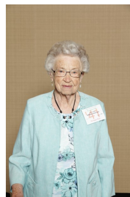
Class of 1941