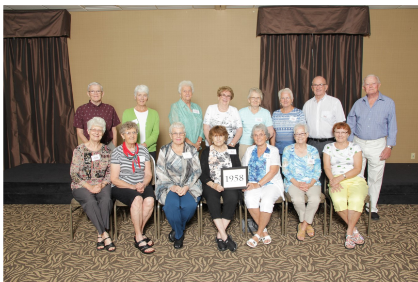
Class of 1958