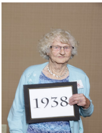
Class of 1938