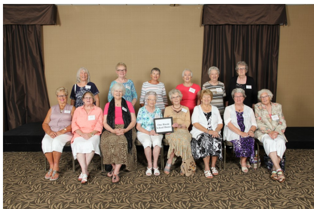
One Room Schoolhouse