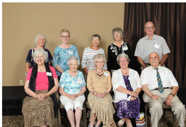
Two Room Schoolhouse