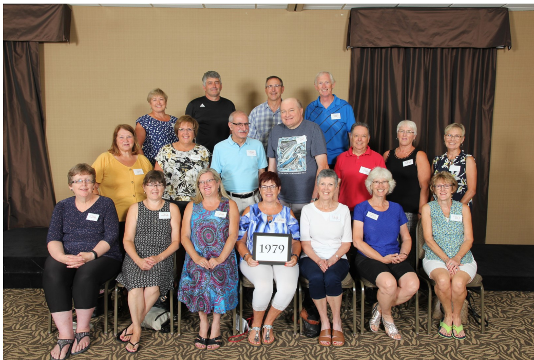
Class of 1979