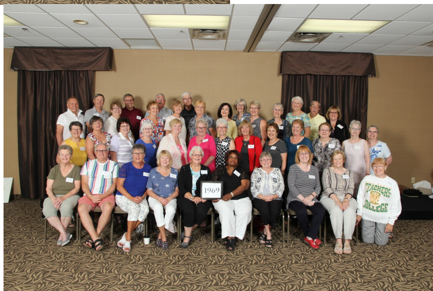
Class of 1969

Class Photos courtesy of Pridham Studios Truro, NS