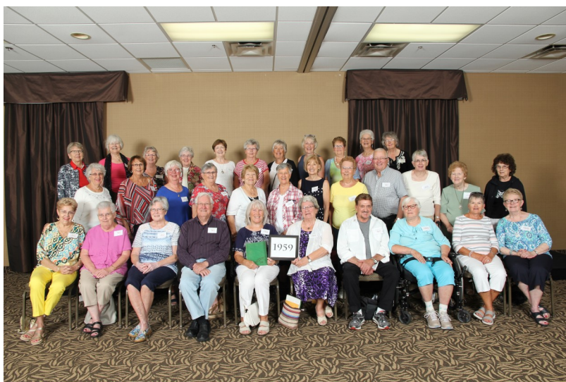
Class of 1959