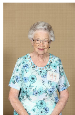
Class of 1941