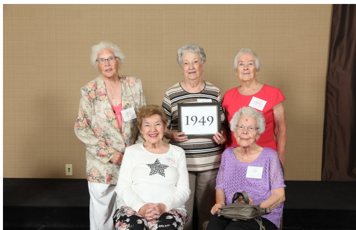
Class of 1949