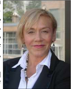
Lenore Zann

This article is largely based on content from the Truro Daily News, September 9 and 30, November 27 and December 15, 2008.