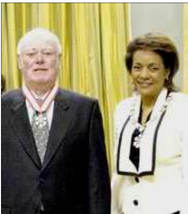
Alistair MacLeod and Governor General Michaëlle Jean

On April 11, 2008 Governor General Michaëlle Jean inducted Cape Breton author and NSNC Alumni Alistair MacLeod into the Order of Canada.