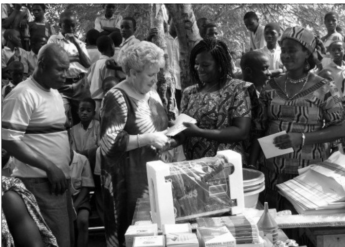
A presentation to schools in Ghana from NSTU Book Mark Project.

Nkabom II is concentrating on the needs of teachers and primary schools in very poor communities across the country. In the past thirty months the