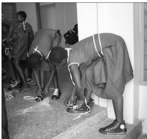
Ghanaian children receiving sneakers (and trying to figure out how to lace them) and uniforms. This was their first experience with either of these items which were provided from

resource persons to thousands of teachers and headmasters in deprived schools in all ten regions of the country. The Canadians and their Ghanaian counterparts have also collaborated in the production